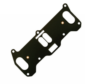
LOWER GASKET SET