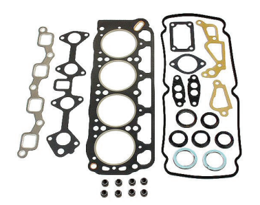
HEAD GASKET SET